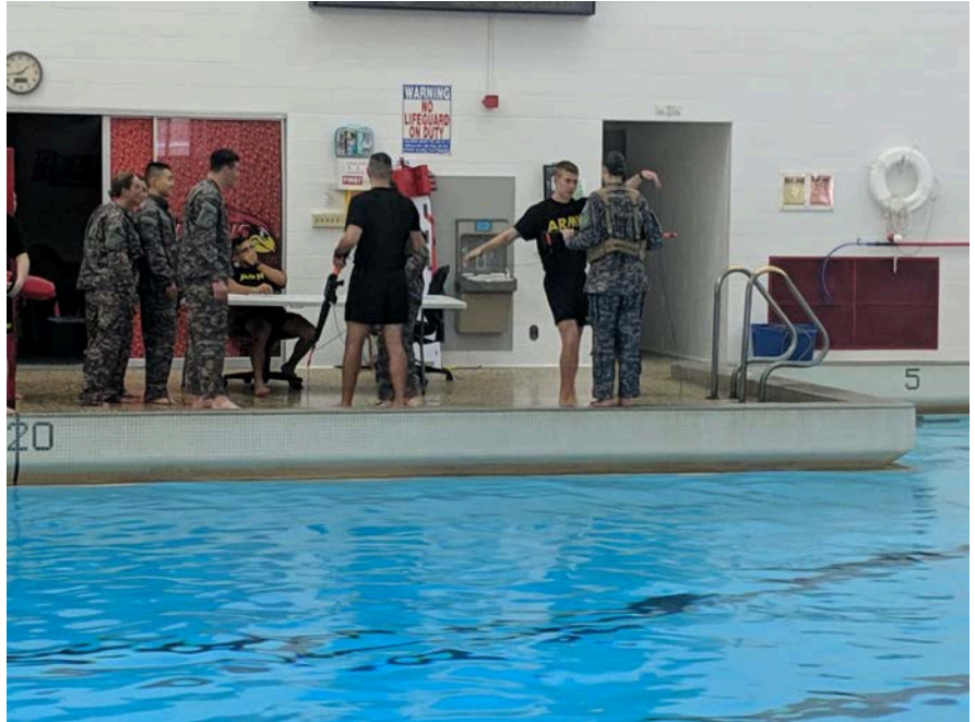
A Cadet getting ready to complete the equipment ditch station.

“Leadership is a potent combination of strategy and character. But if you must be without one, be without the strategy.” - Norman Schwarzkopf