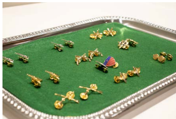
Branch Pins for senior Cadets.

Like us on facebook: facebook.com/illinoisstaterotc