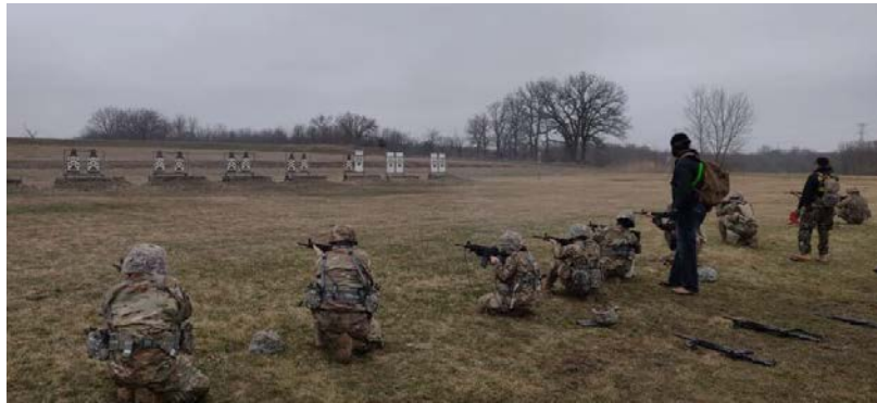
Cadets qualifying on the range.