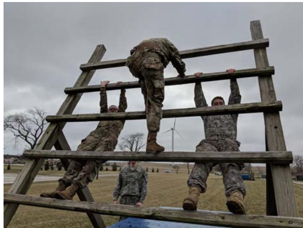
Cadets executing the obstacle course in teams.