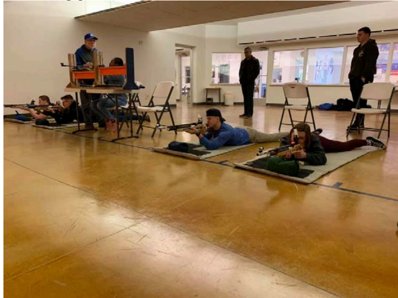
Cadets shooting the air rifles.