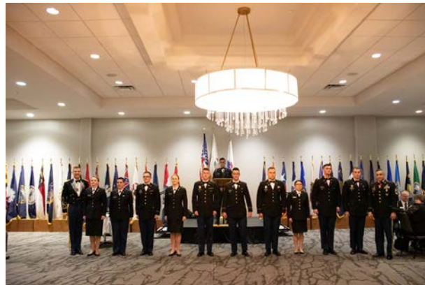
The senior Cadets receiving their branch.