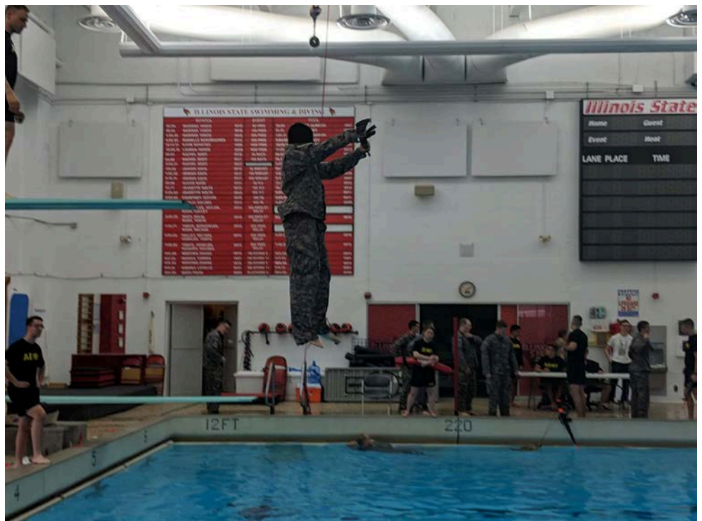
A Cadet completing the high drop.