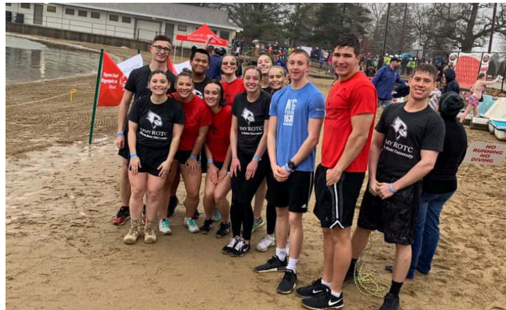
Cadets before taking the plunge into the lake.