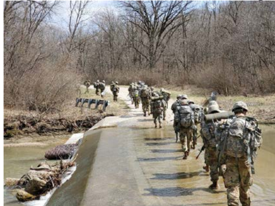
Cadets rucking to their next objective.

This semester Cadets from ISU, IWU, Bradley, and WIU participated in the Spring 2019 FTX. They pulled security through the cold nights, rucked through the fields of the training area, practiced some land navigation spent time on the range working on basic rifle marksmanship, and execution of the confidence course. The platoons also ran through various missions including reacting to contact, raids, ambushes, attacks and recons. The FTX allowed our Cadets the opportunity to get some hands on tactical knowledge.