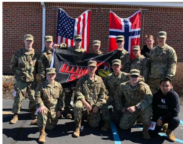
Cadets after completing the Norwegian Foot March.

On March 25 th , 21 Cadets from the Redbird Battalion participated in the Norwegian Foot March hosted by Purdue University’s Army ROTC Program. The foot March consisted of 18.6 Miles while carrying at least a 25 lbs Rucksack. 14 Cadets qualified for the Norwegian Foot March skill badge (foreign award)!