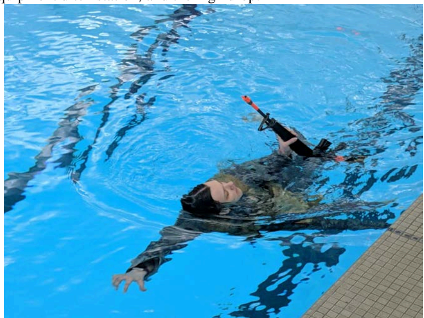
A Cadet performing the fifteen-meter swim.